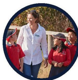
Build skills through fun