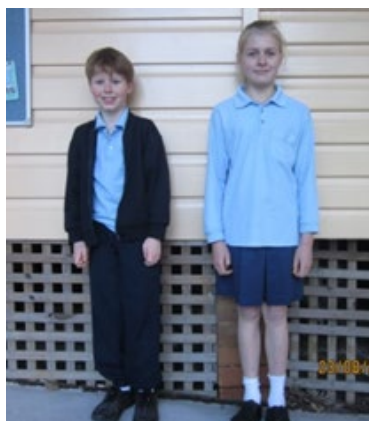
Winter Uniform worn Monday-Thursday White/navy socks or navy stockings

Year 6 are also reminded that their 'Year 6 shirts' are only to be worn on Fridays or other specified sport days.