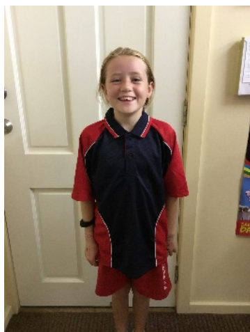
Sports Uniform worn on Fridays. Red jacket and track pants to be worn in winter.