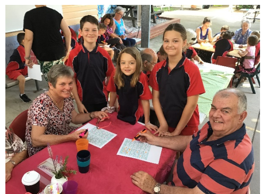
2019 Grandparents Day