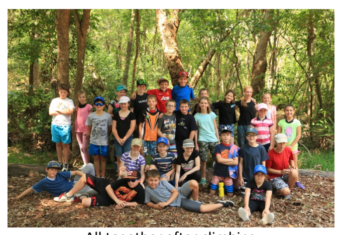
All together after climbing