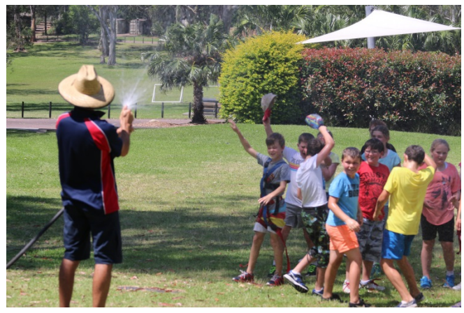
Getting wet after Giant Swing