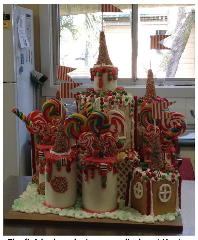
The finished product now on display at Hunter Valley Gardens—wow!!